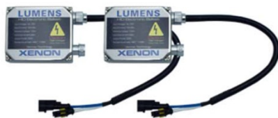
2 x Ballasts