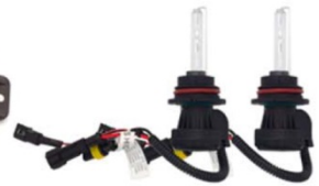
2 x 90047 Bi-Xenon Bulbs