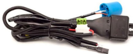
1 x 90047 Harness