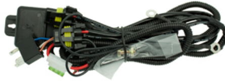
1 x H4 Harness