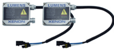
2 x Ballasts