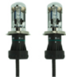
2 x H4 Bi-Xenon Bulbs